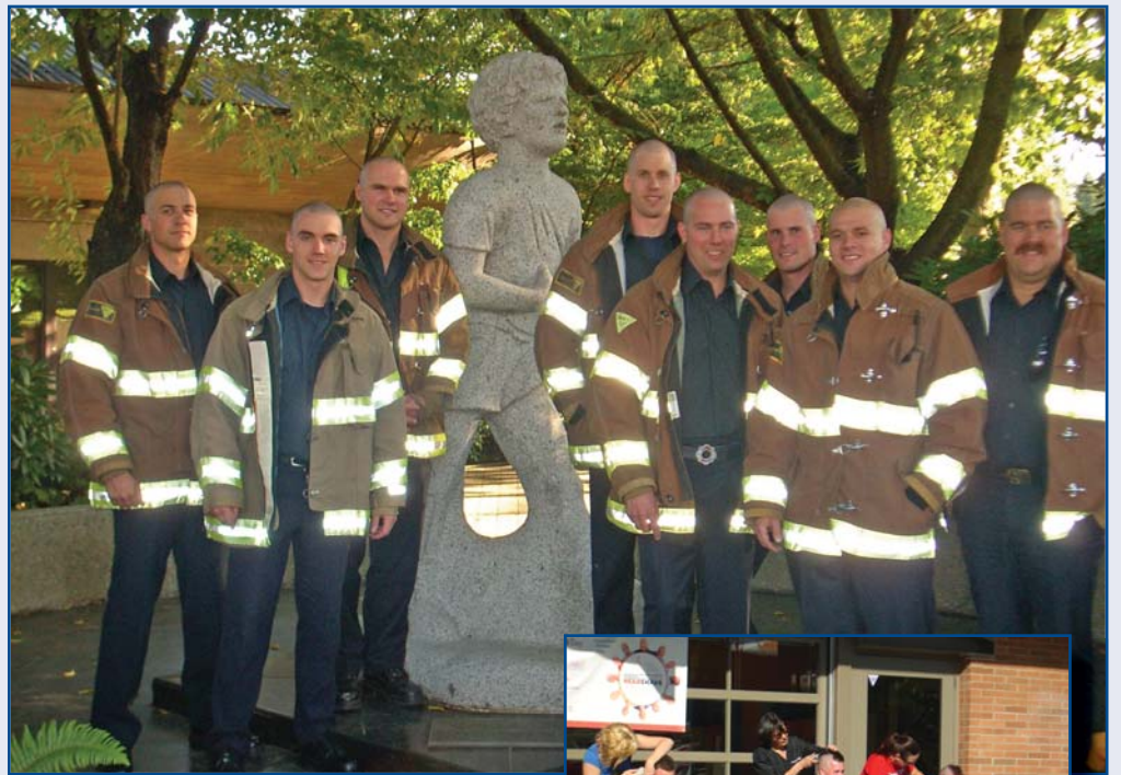
A group of Port Coquitlam firefighters took part in the Great Canadian Head Shave on Sept. 12 and raised over $3,500 for the Terry Fox Foundation.

Details about the new requirements are available in the Summary and Text of Code Changes. Call the City of Port Coquitlam Building Inspection Division at 604-927-5444 to review your application or discuss the Green Building Code requirements.