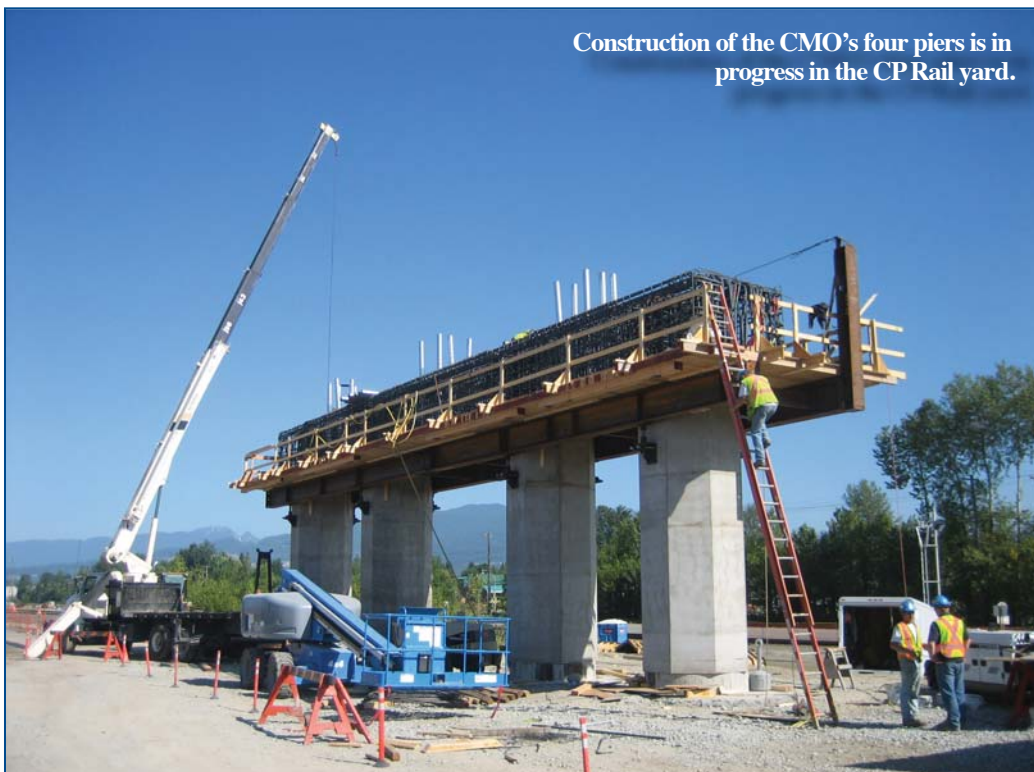
Construction of the CMO's four piers is in progress in the CP Rail yard.

Construction of the Coast Meridian Overpass Project continues, with activities this fall focused on the north side of the project area and in the CP Rail yard.