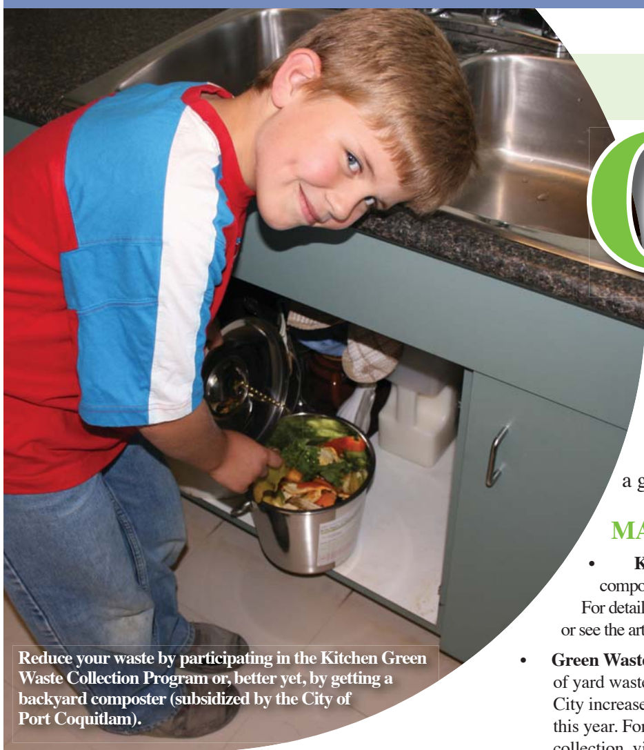
Reduce your waste by participating in the Kitchen Green Waste Collection Program or, better yet, by getting a backyard composter (subsidized by the City of Port Coquitlam).